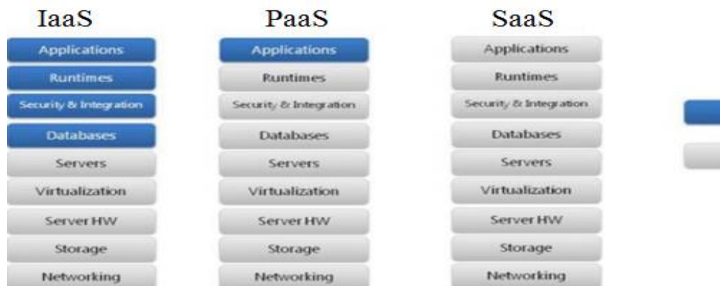
Figure 1: Different organization of cloud services: IaaS, PaaS and SaaS

x SaaS: This version offers solutions to clients according to their demands. A single instance of the solution is carried out on the cloud and also can be used by multiple end customers. There is no requirement for financial investment on the customer side for hardware or software program licenses. As an instance, consider Google Apps or Microsoft Workplace 365 as a regular SaaS provider.