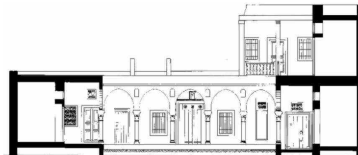
Figure 5: Frontal view of “Dar Khraief”