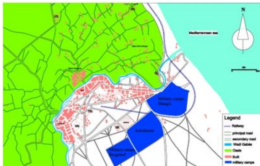
Figure 2: Military camps in the city of Gabes (Personal realization from the plan of Gabes 1942)

During the colonization of the country, the French built their own urban city called ‘BabBhar’ occupying the edge of the oasis in the vicinity of the sea. This new district was characterized by an orthogonal plan in checkerboard, with two main channels bringing together the majority of services and commercial premises. During this period, the settlers directly noticed the strategic position of the city, considered as a desert gateway and a crossroads city. Along this maritime identity, the conquerors created one of the most important French military caserns by building several military camps in the city (housing up to 20,000 soldiers), in addition to an airstrip (aerodrome) which allowed them to control the maritime routes, land and Sahara all over southern Tunisia (Fig. 2).