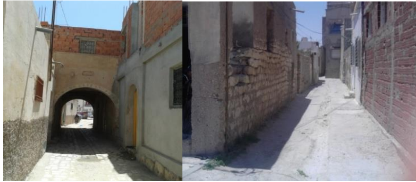
Figure 7: Disruption of urban landscapes