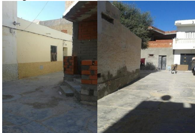
Figure 6: Brick and concrete constructions invading the Medina

As seen in the photos (Fig.6), the cement brick constructions have replaced the traditional houses around the oases because of the fragmentation of these houses and their transformation into several houses usually quite disfigured. In the same way, oasis dwellings have witnessed the alterations of the random interventions of the residents who do not respect the architectural specificity by using materials foreign to the traditional prescriptions (introduction of industrial brick, cement, steel, wall tiles with industrial painting and non-matching colors), by adding new spaces that do not conform to the typology of old structures or by carrying out commercial activities unrelated to the vocation of these dwellings.