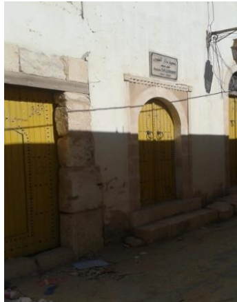
Figure 4 : Photo of a main access door of a traditional dwelling

A main access door high enough to allow the animals used in the oasis to transport crops brought from the oasis and elsewhere (Fig. 4). In fact, the front door is usually the only opening on the main façade of the house.