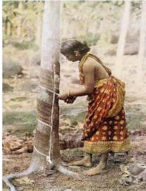
Figure 1: A woman in Sri Lanka harvesting rubber. 1920

and how it has surpassed most other man-made materials In the further research, the relationship between plastic and its user within the sphere of construction will be investigated.