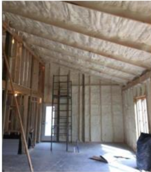
Figure 3: foam spray wall insulation

like pipes' and cables' insulation, storage tanks, skylights, roofing, windows and doors, insulation and temporary structures can be made entirely, partly or as a bonding compound in new material mixes like WPCs- wood-plastic composites, carbon or natural fiber reinforced plastic. Material of this study has a vast application in the field of tensile structures construction or tents in smaller scale. One of the most common uses of plastic in the building construction is insulation of large surfaces such are walls, roofs or floors that can come in different forms-commonly in foam which amounts can be adjusted to fit any forms, in a prefabricated form like SIP panels. As well as to securely insulate smaller details like pipes or cables, it is frequently used in the tiling of the exterior building planes too (Hopewell J; Dvorak R & Kosior E 2009, p.1-2).