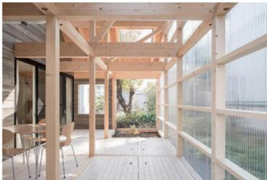
Figure 3: House in Shinkawa / Yoshichika Takagi