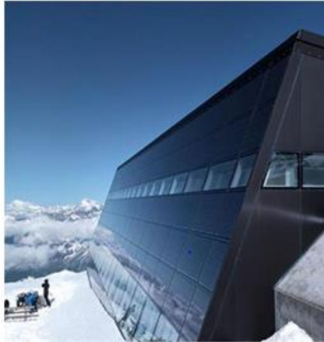
Figure 4: Glacier Restaurant, Klein Matterhorn, Zermatt, Switzerland