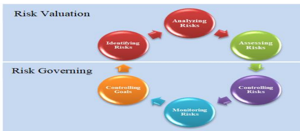
Figure 2: Stages of the managing risk process

The risk potential analysis of a project states to what extent project risks influence the risk situation of the enterprise. Risk potential should be estimated without a detailed consideration of the individual risks at as little expense as possible (Vyas&Raol, 2017). Depending on the assessment of the risk potential, the risk management process is set in motion (Nocco&Stulz 2006; De Bakker et al. , 2010). Managing risk process comprises the integration of basic principles of risk policy, the establishment of a risk-consciousness as well as the organizational integration. It is an impetus for the risk management and is responsible for the control of risks in full knowledge of the current risk situation (Schieg, 2006; McManus, 2012). Through the managing risk process, transparency increases, many problems can be avoided from the outset through proactive action, the project can be prepared for unavoidable problems. Through this, the consequences can be mitigated, and the project manager retains the control over the project (Richardson et al. , 2009; Sparrow, 2011; Vyas&Raol, 2017). Thus, the risk management process consists of stages represented in Figure 2 that have a direct impact on successful construction project management, which will be discussed in the following paragraphs.