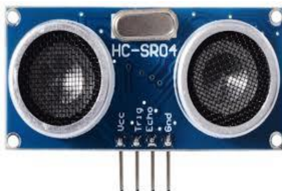
Figure 3: Ultrasonic Sensor

Here we are using 2 Ultrasonic sensors. It is a type of electronics component that uses ultrasonic transmitter and receiver pair to send and collect signals resulting in proper sense of obstacles. The more the resonant frequency the lesser will be the wavelength of transmitted radiation and it will provide good surrounding condition. The more directional the sonic wave the more resolution in the measurement come. Sensitivity helps in decreasing signal to noise ratio. Here we used two transducers of 40khz.as shown below.