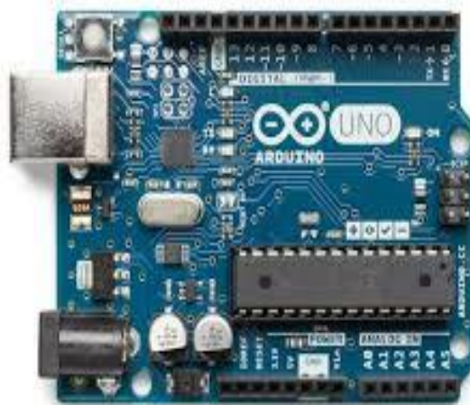
Figure 1: Arduino (AtMega 328P)

Arduino plays a major role in automation .It acts as brain of the robot .It operates around the voltage of 3.3 volt. It uses atmega16 on its core which uses ARM processor .It has 28 digital I/O pins and 6 analog output pins. From 28 digital pins 6 are PWM (Pulse Width Modulation) pins. 2 DAC pins use 16 bit resolution and operates by the help of analog Write () function. It has 1 USB ports. Such as:-Programming USB port, Native USB Port We can feed the program through programming USB port . Every program has 2 functions in its body.