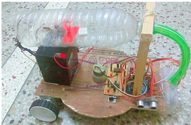
Figure 6: Fully Automated Hybrid Home Cleaning Robot

Vacuum is used to suck the dust from floor. We used a 5000 rpm motor for this, best part in our vacuum is the use of unused materials like water bottle. It can suck all the dust from floor. We use this on different size debris like paper and dust and it is working well.