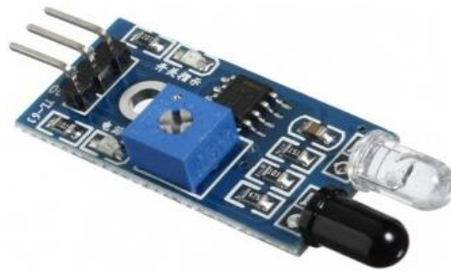
Figure 4: IR Sensor