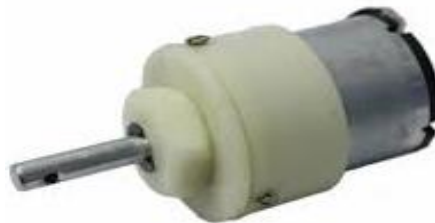
Figure 5: DC Motor

DC motor is an electrical machine that utilizes electric power resulting in mechanical power output. Normally the motor output is a rotational motion of the shaft. The input may be direct current supply or alternating supply. But in case of DC motor direct current is used. The mechanism of dc motor is like a bar wound with wire is placed in between 2 magnets having North and South Pole. When it is provided with electric supply the wire becomes energized resulting in rotational motion which leads to rotational output. Here we are using two 100 rpm dc motors for wheel driving and one 300 rpm dc motor for rotating the mop.