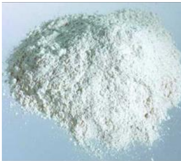
Figure 1: Asbestos electrical insulation