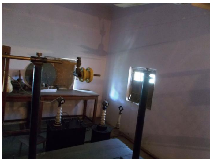
Figure 3: Coated insulator testing in H.V. Lab

Experiments are to be carried in high voltage lab of JEC (JABALPUR ENGINEERING COLLEGE, JABALPUR) in EE Department Jabalpur.