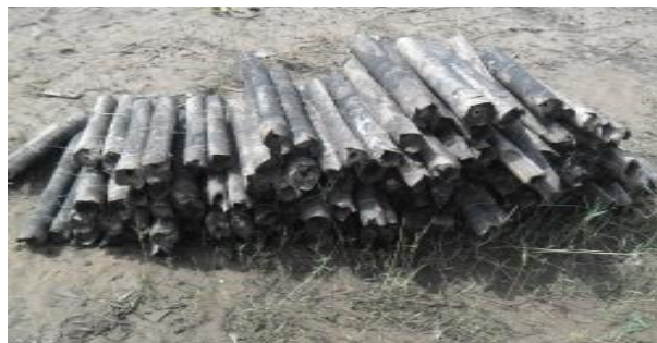
Figure 6: Heap of bamboo-traps