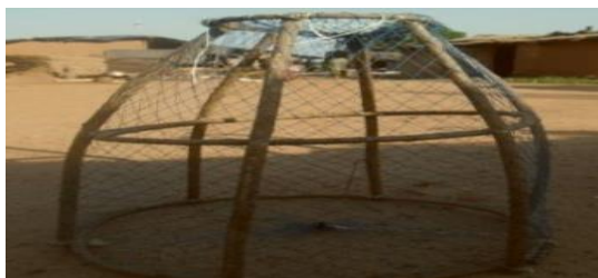
Figure 5: Conical fishing basket (papolo)