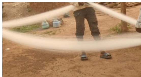
figure 3: bottom lines