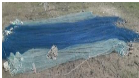
Figure 7: Shore seine