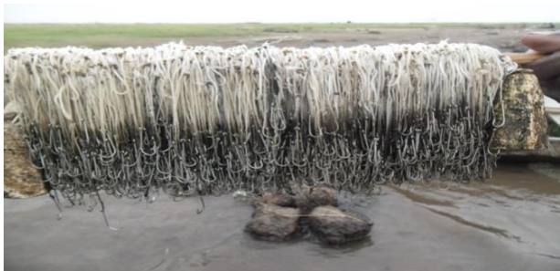
Figure 2: gillnet