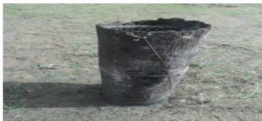
Figure 4: Conical fishing basket (coconut wood)